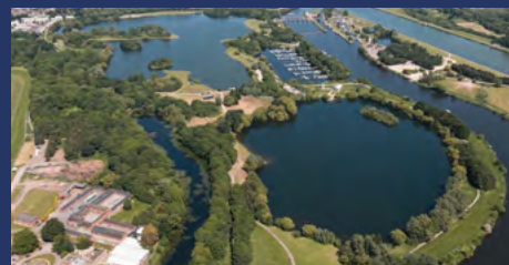
Nottingham – National Water Sports Centre

We are based in modern offices at the National Water Sports Centre in the Holme Pierrepont Country Park, Nottingham. In addition, we also operate a High-Performance Centre at the 2012 Olympic site in Lee Valley.