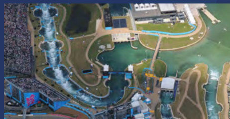
Lee Valley – White Water Centre

Paddle UK is the UK Governing Body for the sport and recreation of canoeing, stand up paddleboarding and kayaking, with a mix of UK and England specific responsibilities. We currently employ around 100 staff with around half working within our World Class Performance Programme and England Talent Programme and the remainder within other areas of work including; Development, Coaching, Membership Services, Finance, People, Governance, Commercial, Digital & Marketing and Communications.